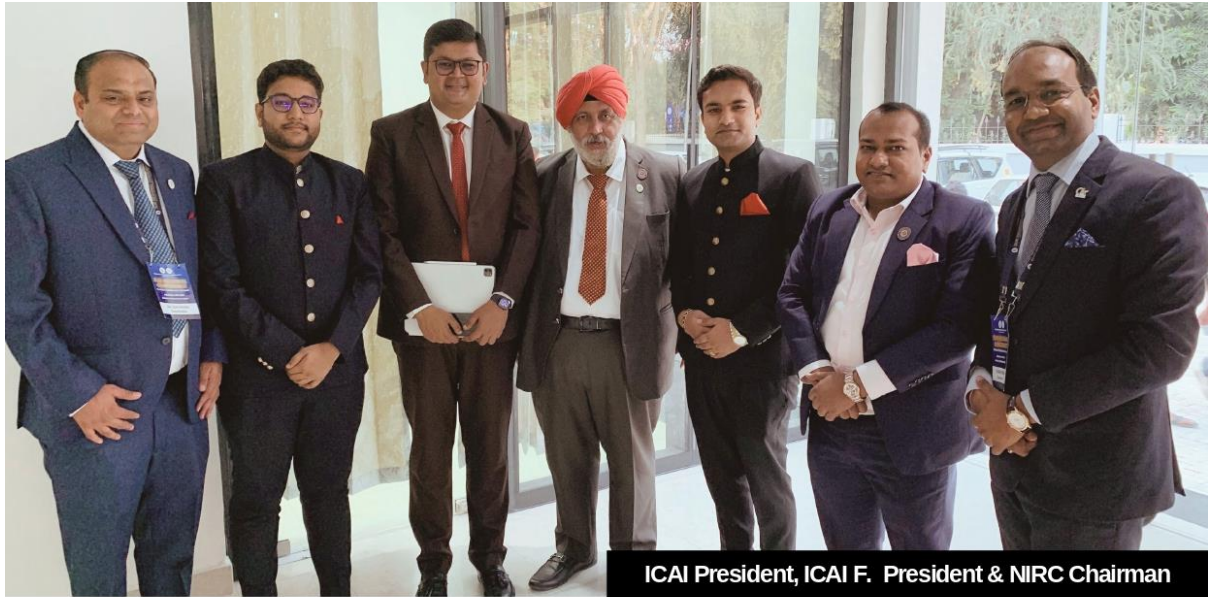
ICAI President, ICAI F. President & NIRC Chairman