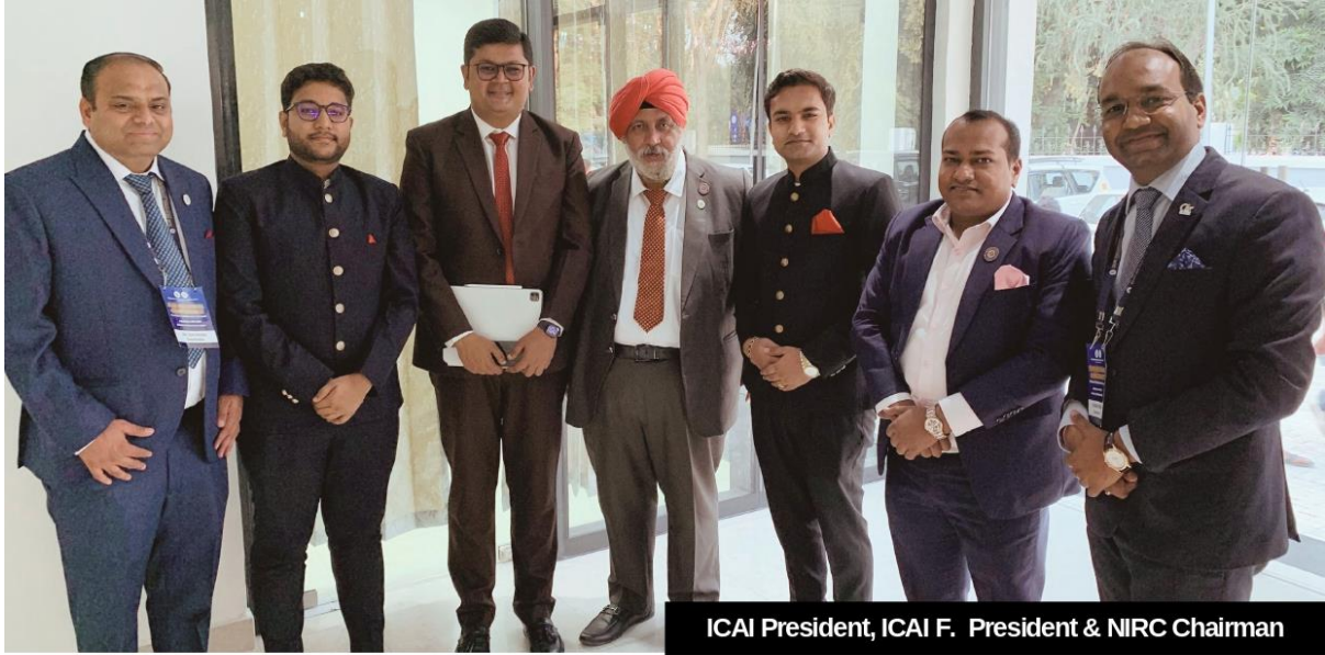
ICAI President, ICAI F. President & NIRC Chairman